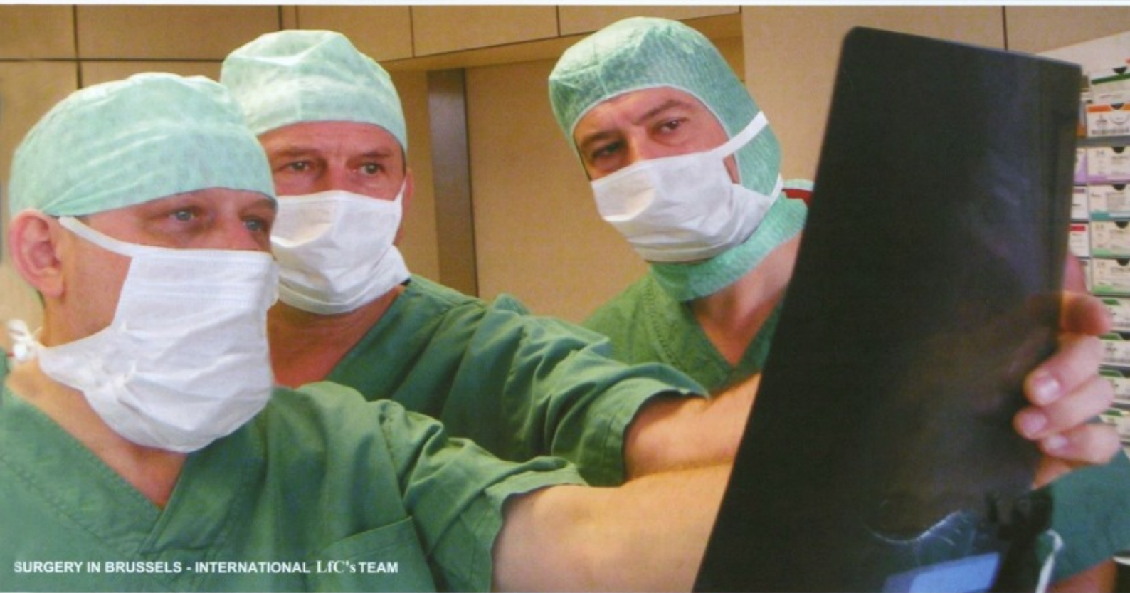
SURGERY IN BRUSSELS - INTERNATIONAL LfC's TEAM